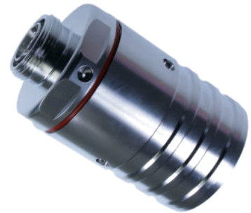
RADIAFLEX connector 716F-RA158-P01

These premium performance coaxial cable connectors are designed specifically to provide the highest quality connector-cable interface while simplifying and speeding up the attachment of connectors to RADIAFLEX® cables. The connectors provide outstanding value to users because they permit quick, easy and reliable installation at any location, thereby allowing the operator flexibility while saving installation time and money. They attach to prepared cable in one piece assuring error-free attachment. All connectors are fully tested for mechanical and electrical compliance specifications.