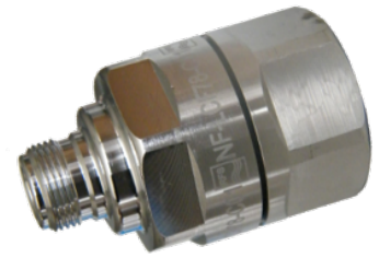
OMNI FIT™ Standard Connectors

OMNI FIT™ high performance connectors are designed for use with both CELLFLEX® (copper) and CELLFLEX® Lite (aluminum) cables. They are designed specifically to provide the highest quality connector-cable interface while simplifying and speeding up connector attachment. All RFS connectors are fully tested for mechanical and electrical compliance to industry specifications. The N connector is one of the most common RF connector types and meets all requirements even under the most severe environmental conditions.